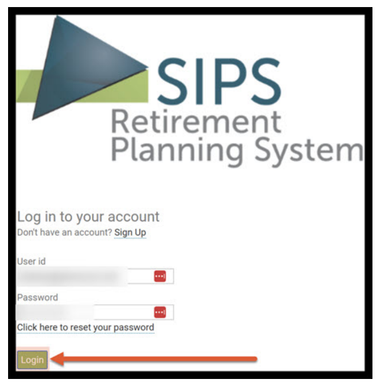
Step 1: Logging In: Log into SIPS.

Step 2: Welcome Page: To navigate to the Your Case List screen, you have two options: click the green Go To Your Case List button under the Welcome heading, or select Your Case List in the upper-right corner. Both options lead to the same Your Case List page.