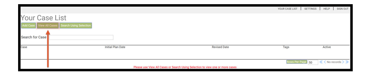
Step 4: Your Case List: All your active cases will be displayed in a list format.